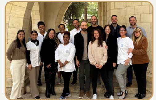
HaTikva staff in Israel

We invite you to be a part of what the Lord is doing today in and among His people. Our partners have always desired to bless and care for Israel and the Jewish people and are answering the invitation to "Comfort those who mourn in Zion."